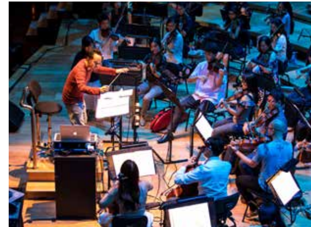
Conducting the Metropolitan Festival Orchestra at 'KoFlow-MFO RELOAD: A Turntable-Orchestra Programme' at Esplanade Concert Hall, 2018.