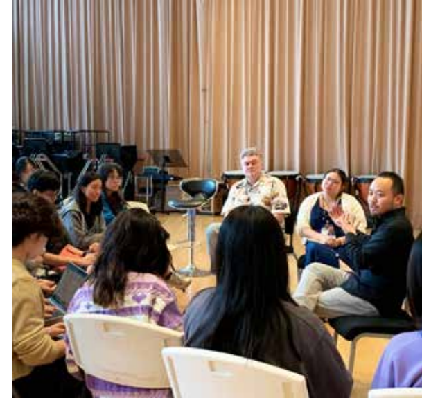
Masterclass at School of the Arts, 2023.

There is no typical day. It depends on the production(s) I am working on. When I started working professionally in 2007, I acted in school